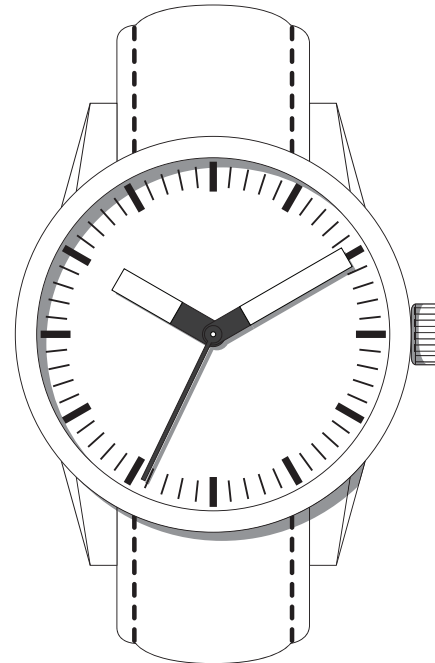
52MM 2.00 INCHES