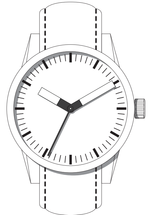
56MM 2.20 INCHES